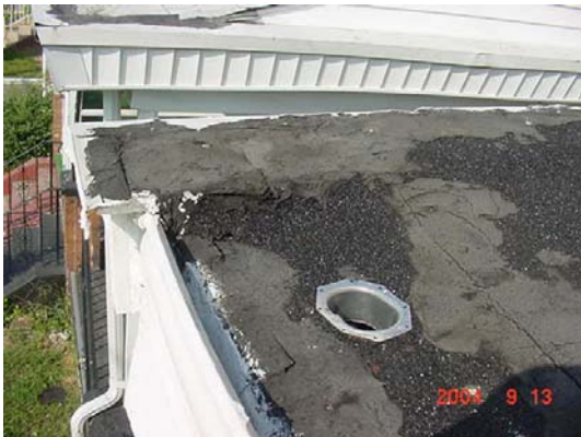
Photo 7 – Hot mopped roof is cracking and the roof drain is easily blocked by leaves and balls thrown onto the roof.