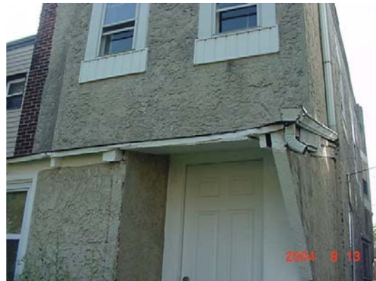
Photo 5 – Rear left corner is damaged allowing water to intrude exterior.