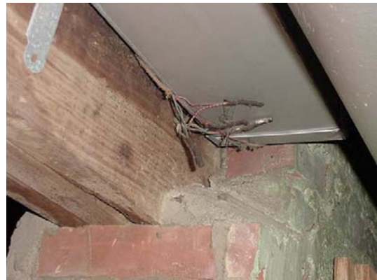
Photo 10 – Open wiring is dangerous and a code violation. All splices must be in a junction box.