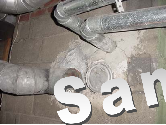
Photo 12 – Loose exhaust stacks are a carbon monoxide risk. Multiple stacks in this arrangement are out of code compliance.