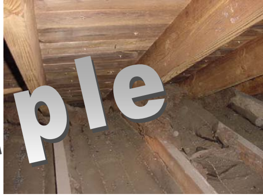
Photo 14 – Cellulose insulation is minimal and chocks off ventilation where adequate. Recommend adding R-19 fiberglass batts with rafter vents to assure proper ventilation through soffit.