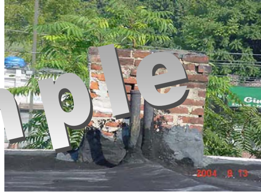
Photo 9 – Loose bricks need pointing, close vent stacks are difficult to keep sealed. Recommend replacing chimney flue and add a rain cap.