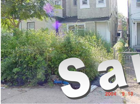
Photo 6 – Over grown vegetation and rubbish indicates prolonged neglect.